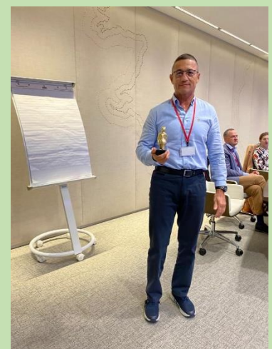
(T Nita 2022)