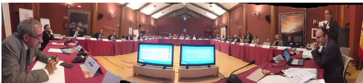
Panoramic view of the workshop session, Day 1: 09 May 2018